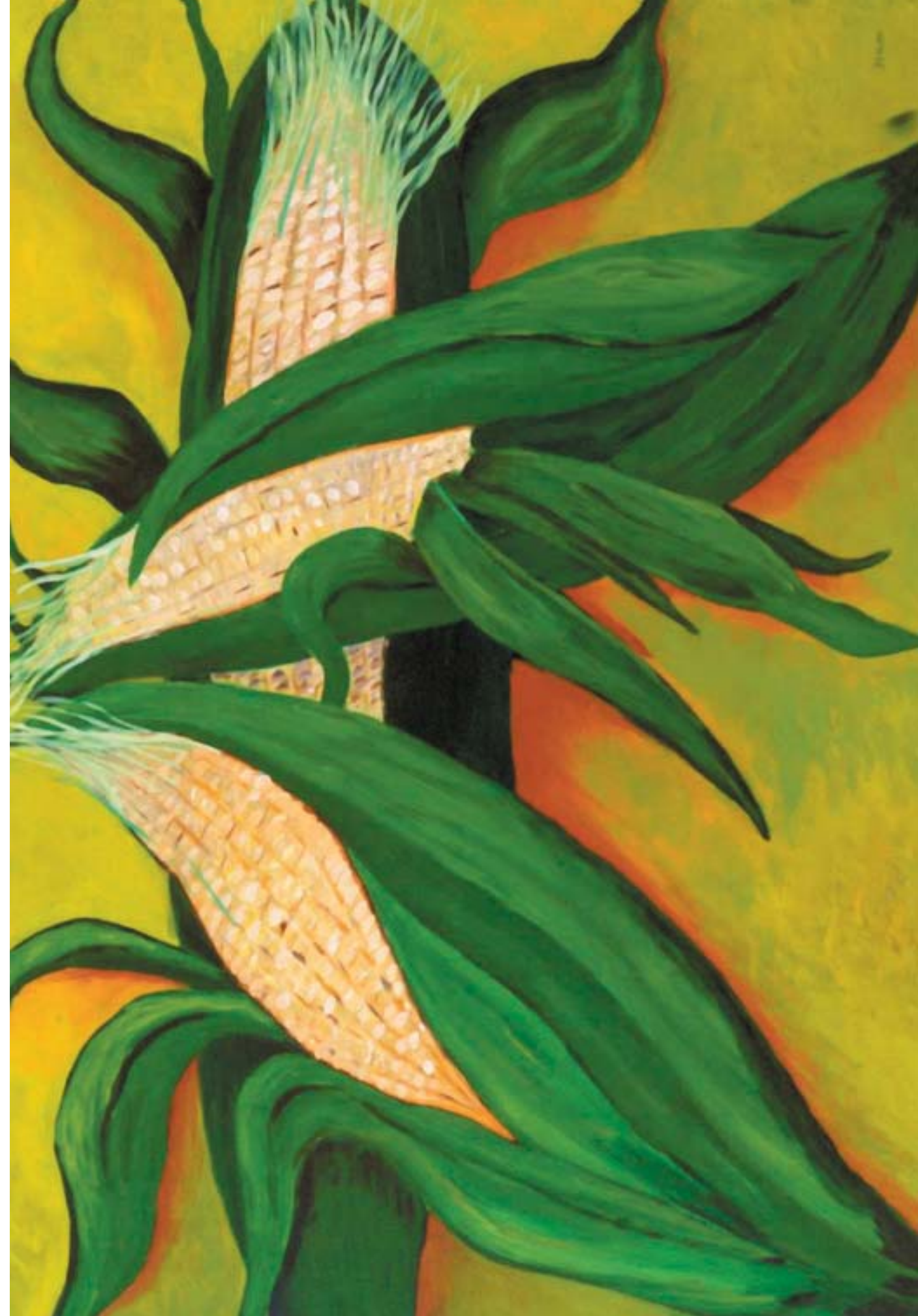
Mexican Corn (30x40, acrylic on canvas)

In a soup pot over medium heat, glaze the onions and potatoes in olive oil, then cook with the water until tender. Transfer to blender and puree. Return to pot and add fennel and cauliflower, along with chicken stock. Simmer until done and add salt, white pepper, and saffron. Garnish with fennel foliage.