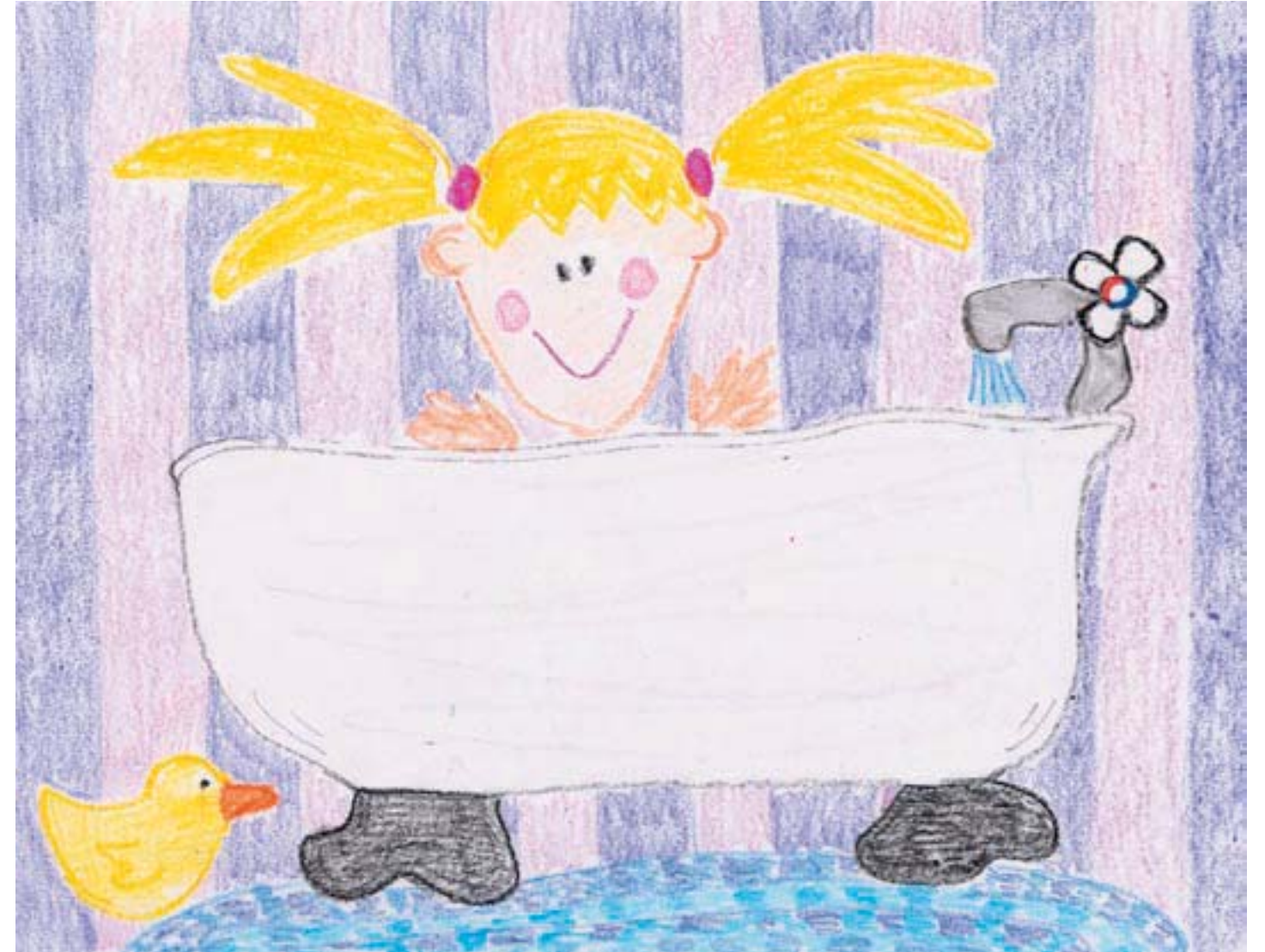
Abby loves taking a bath. The warm water feels nice.