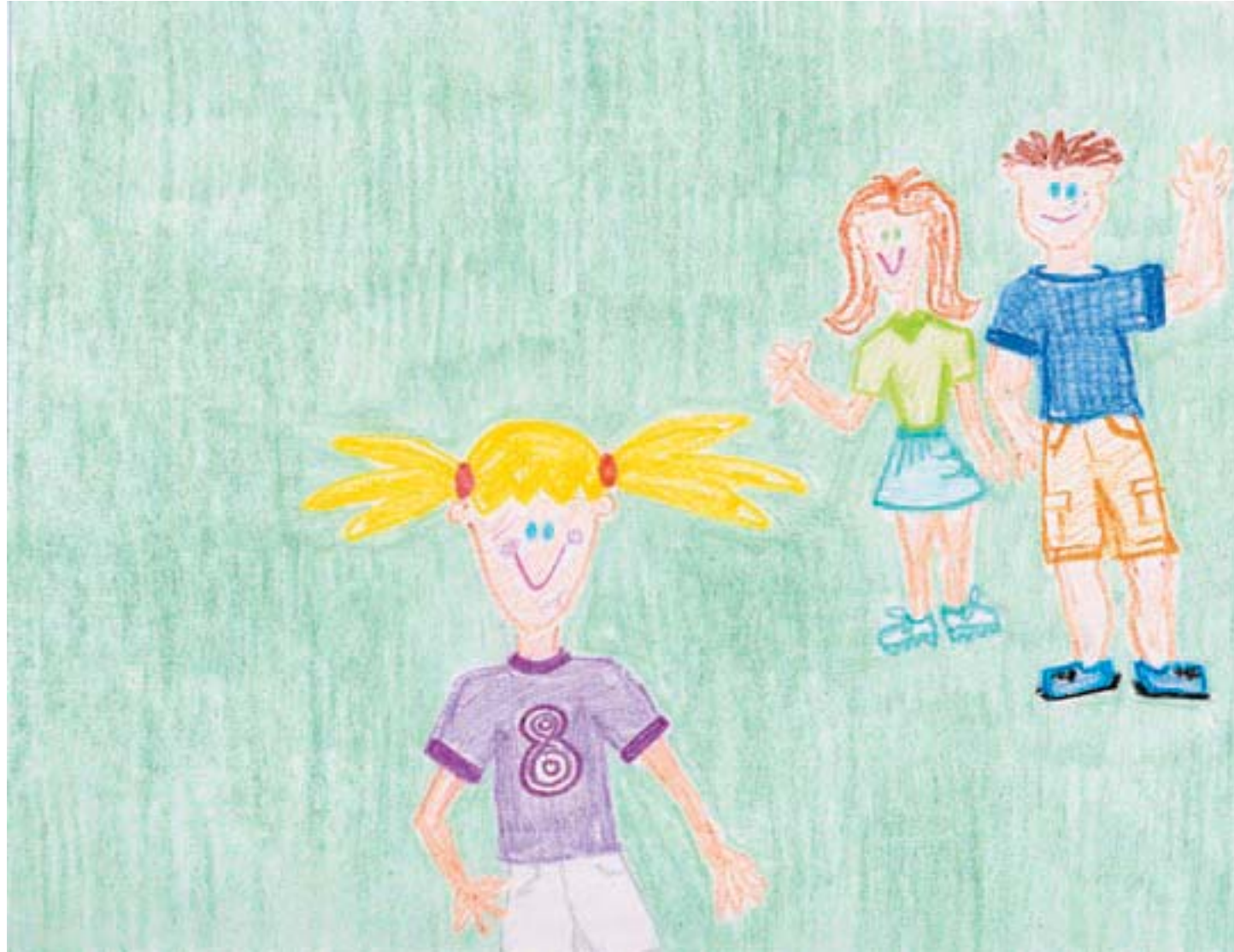
After a long day of playing with friends, Abby likes to get clean.